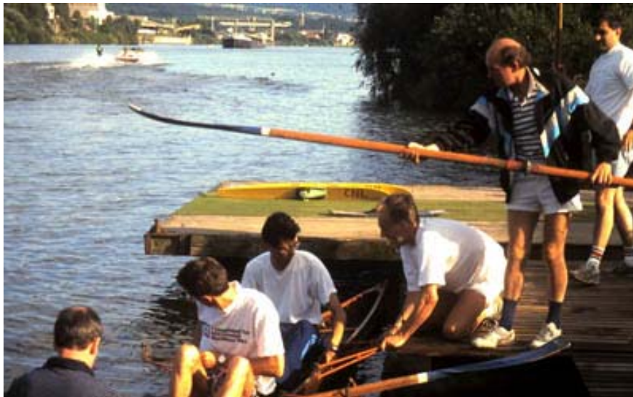
LIRC founding members with the first own boat

12 July coxed double scull Häensel (Ermesinde) brought from Saarburg